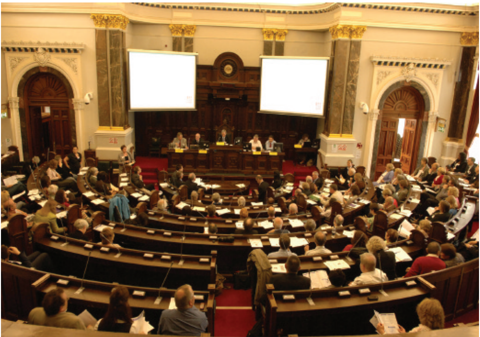
BASW UK Annual General Meeting: 30 April 2009, Birmingham Council House